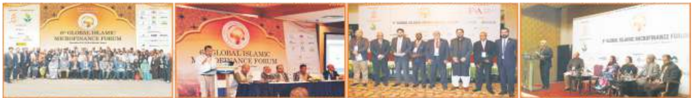
4th Global Islamic Microfinance Forum 2014