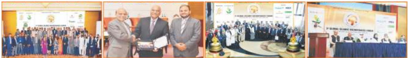
3rd Global Islamic Microfinance Forum 2013