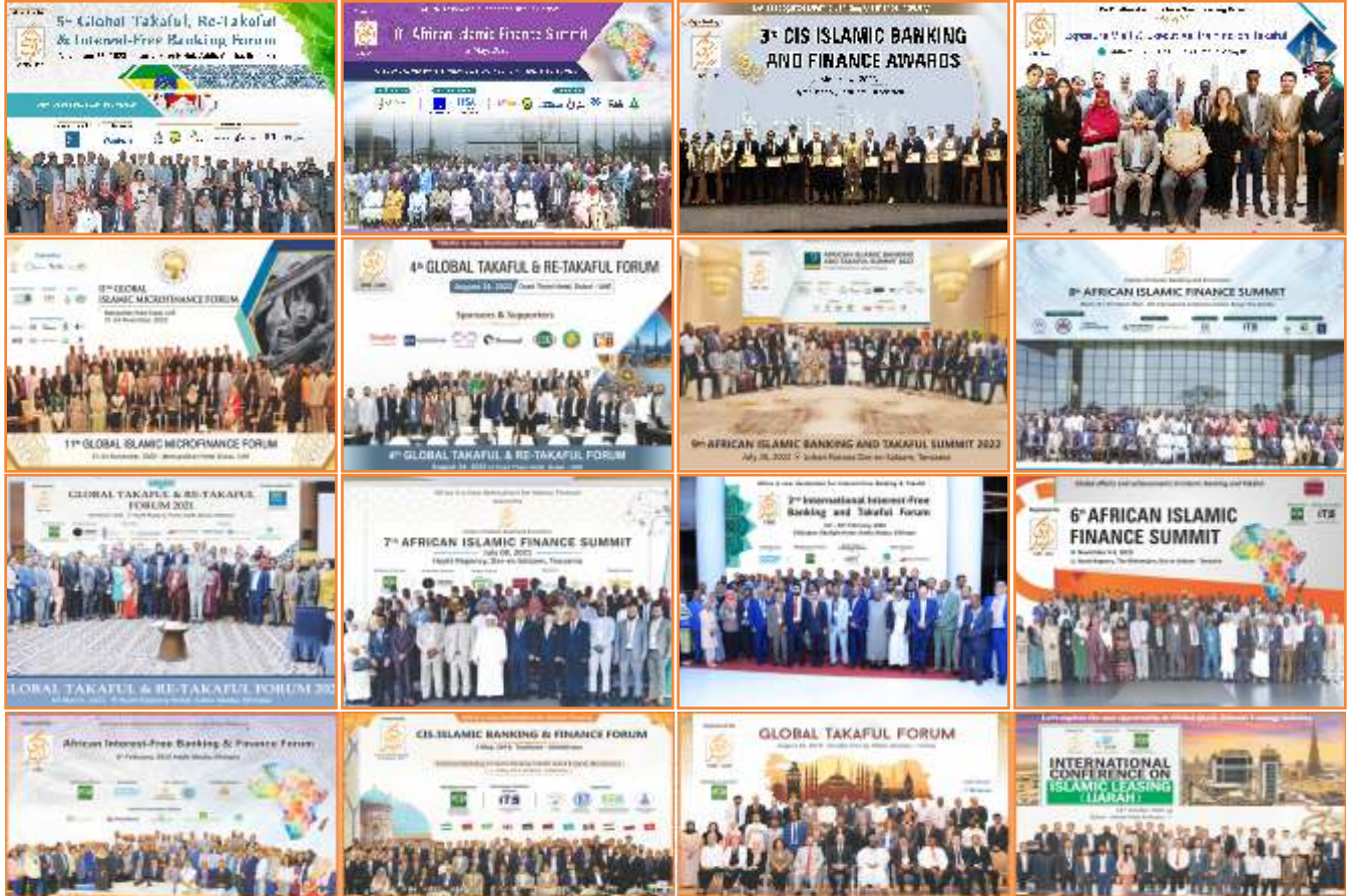
8th Global Islamic Microfinance Forum 2018